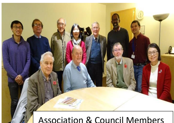
Association & Council Members