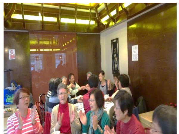
All singing aloud at Fundraising Lunch, Dec 2017