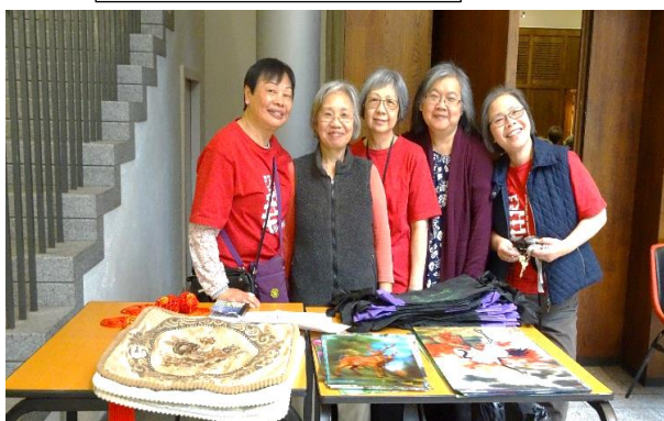
Volunteers & Staff